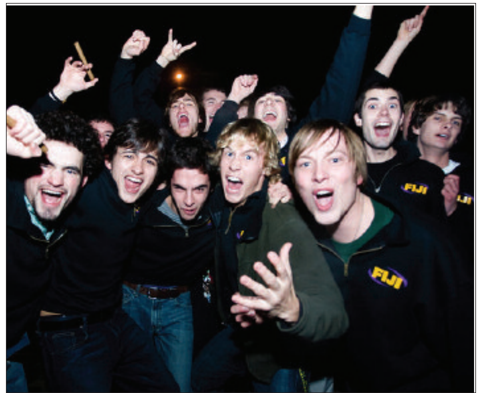
Enthusiasm on Bid Night—Fiji takes 20 pledges!

We've started a few new Lambda traditions. One of these is our Tuesday night bonfires. On evenings when the weather cooperates, we gather at the pit in our backyard, grab some snacks, and talk by the fire. It's been great for our brotherhood. Also, one of our newer committees,