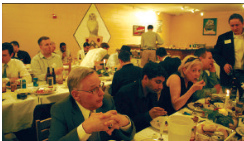
The dinner crowd eating, talking, and being merry!