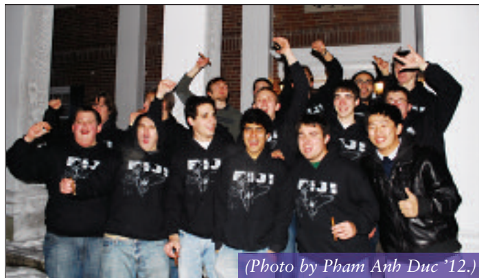
Lambda's newest brothers on Bid Night 2010.

was more than happy to correct the details if they were to be slightly off. The home-improvement projects and philanthropies were created and organized with much gusto at the meeting, and we formed a laundry list of ideas that would take a semester to complete, not factoring in the fact that DePauw academics take a hefty toll on our free time. A good number of pledge brothers made a point to help support the Special Olympics basketball teams one weekend by cheering them on during the game, and then afterward, forming a victory tunnel for the players to run through as they left the court. The best part of this was that everyone wanted to be there—no one acted as though he or she was on the clock at a dead-end job. The enthusiasm poured out genuinely and effortlessly as we gave our enthusiastic support.