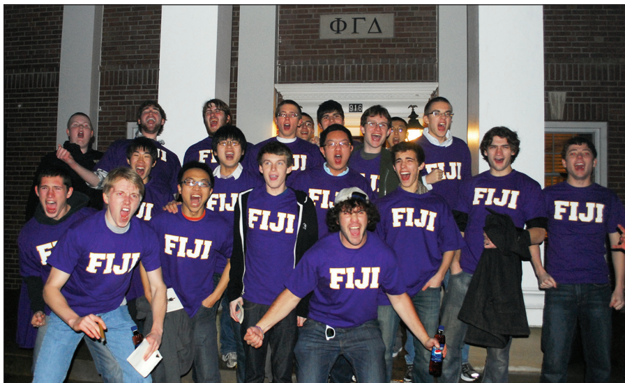
Pledges show their excitement about joining Lambda Chapter on Bid Night.