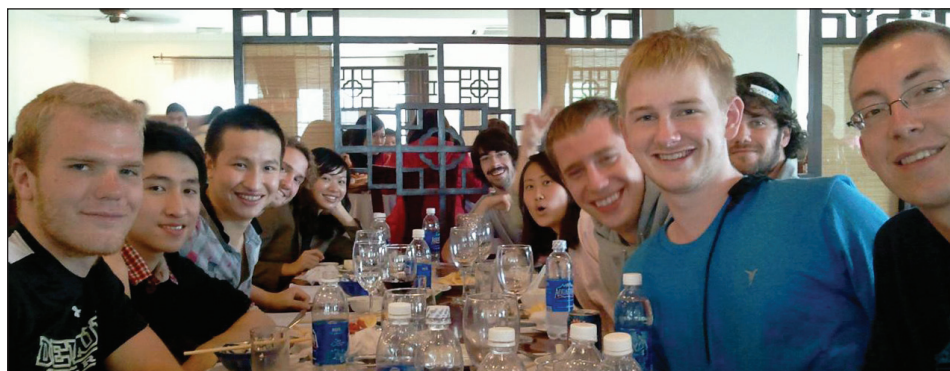
Brotherhood around the world: FIJIs share a meal abroad in Southeast Asia.