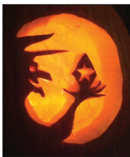
Pumpkin Bash 2011

The Lambda Chapter of Phi Gamma Delta had a very successful semester in terms of philanthropy. We had two major philanthropic events that were organized by the chapter. The first event this fall was the FIJI-Theta Bark-B-Q. We have always held this event with the ladies of Kappa Alpha Theta with a goal of raising money for the Putnam County Humane Society. However, we