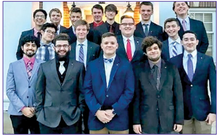
2018 spring pledges.

Greek life at DePauw has been changing and less freshmen are willing to be sold on the idea of fraternity life. The negative image of drinking and recklessness that is associated with Greek life has made it harder, and in some ways easier, for freshmen to figure out