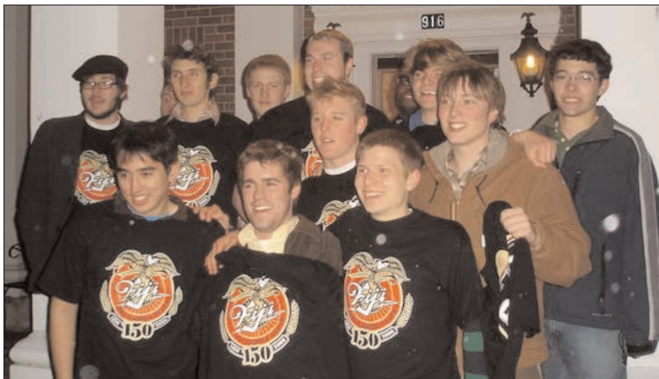
The Lambda Chapter welcomes its 13 newest members. (See related box, page three.)