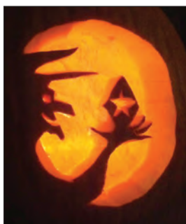
Pumpkin Bash 2011

The Lambda Chapter of Phi Gamma Delta had a very successful semester in terms of philanthropy. We had two major philanthropic events that were organized by the chapter. The first event this fall was the FIJI-Theta Bark-B-Q. We have always held this event with the ladies of Kappa Alpha Theta with a goal of raising money for the Putnam County Humane Society. However, we