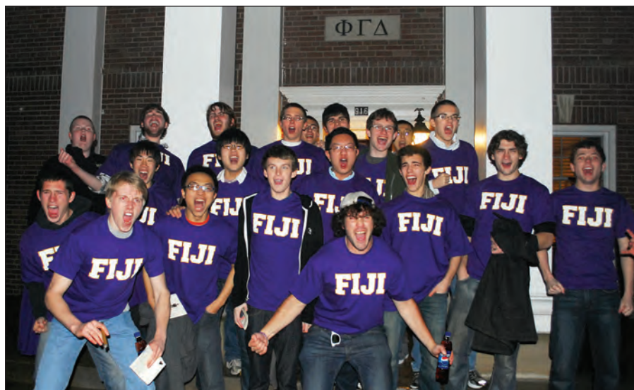
Pledges show their excitement about joining Lambda Chapter on Bid Night.

FIJI’s 2012 pledge class is a well-rounded group of individuals. Over the next four years, they will continue to uphold the long-standing tradition of excellence in Phi Gamma Delta. It is the honor on behalf of the 2012 pledge class to be welcomed to the brotherhood of the Lambda Chapter of Phi Gamma Delta.