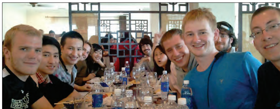
Brotherhood around the world: FIJIs share a meal abroad in Southeast Asia.