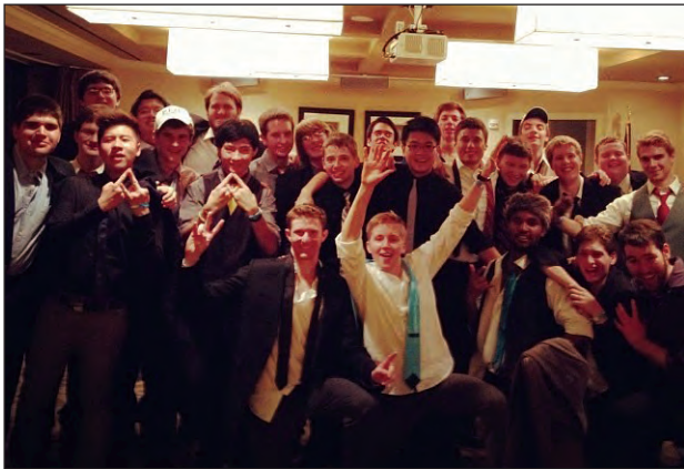
The active brothers having fun together!