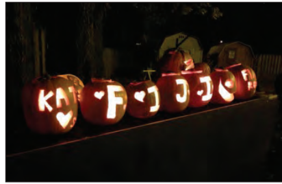
Pumpkin Bash 2013