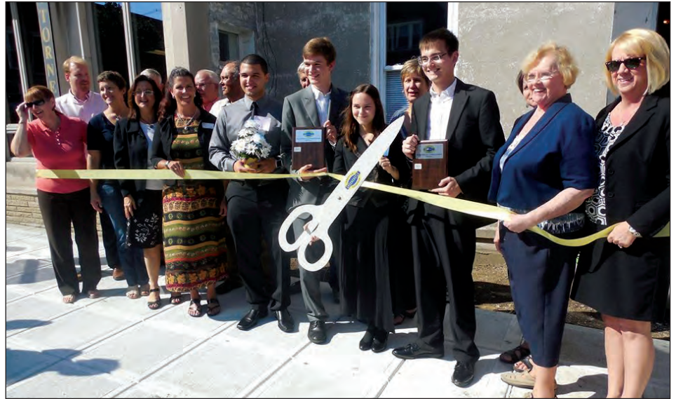
WynWay Technologies, LLP, opens its door in Greencastle.