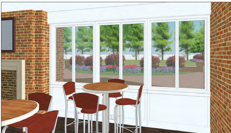
This is the proposed new view southward from the dining room expansion. A new patio and landscaping will dramatically upgrade our outdoor facilities, and a fireplace and casual study spaces will make the dining room a central gathering point within the house.