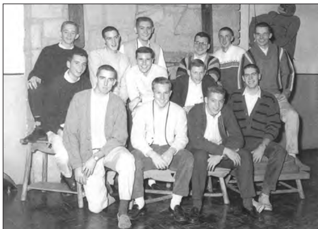
1959 Pledge Class, The Bakers Dozen .