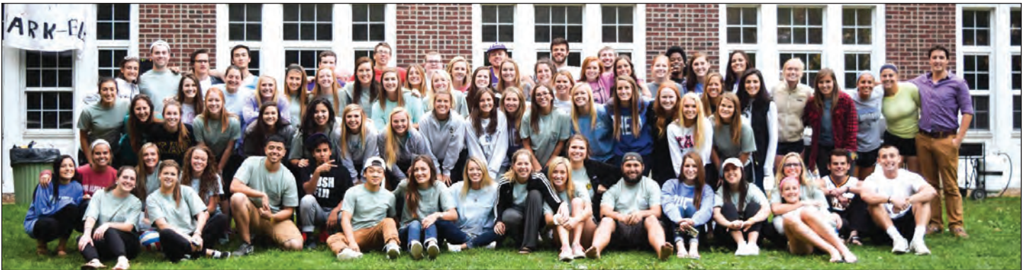
The Lambda Chapter posing with the members of Kappa Alpha Theta during their joint philanthropy, "Bark-B-Q."