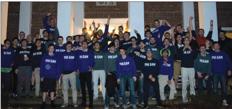
The Lambda Chapter of Phi Gamma Delta together. We will dearly miss the class of 2015!

Looking to the future, I hope that this position will encourage Greek life in all organizations to dedicate themselves to the discussion on diversity. I hope that DePauw develops into a community in which all-incoming students feel accepted and experience compassion. Lambda's commitment to this cause makes me prouder than ever to be a FIJI.