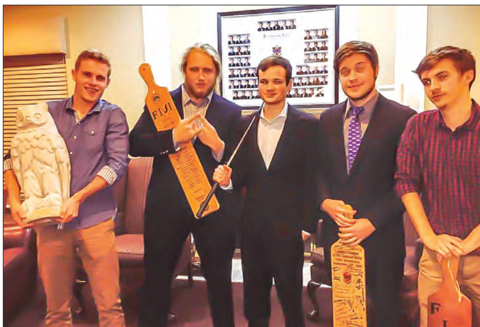
The new undergraduate officer cabinet