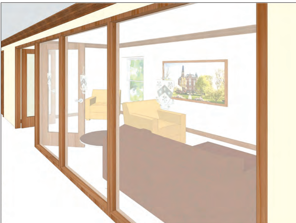
Rendering of the new second- and third-floor study lounges.