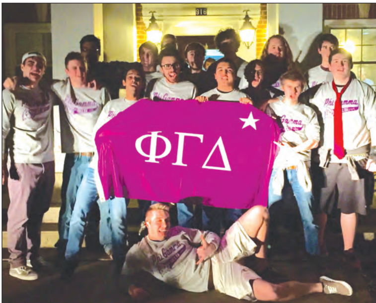
Fiji's newest pledge class.