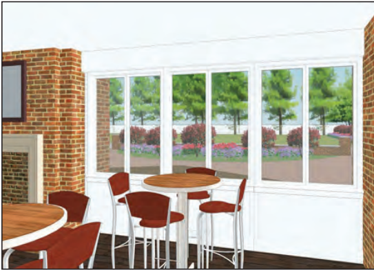
Top: South view from dining room. The dining room is being expanded with additional study areas.