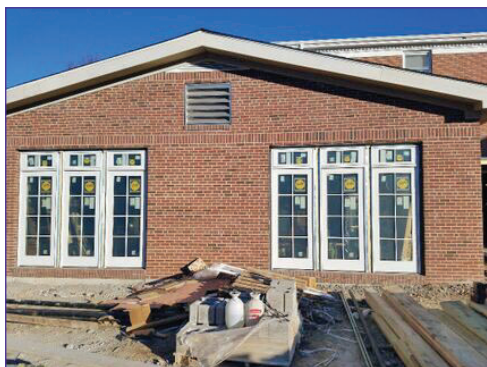
The latest progress on the new library.