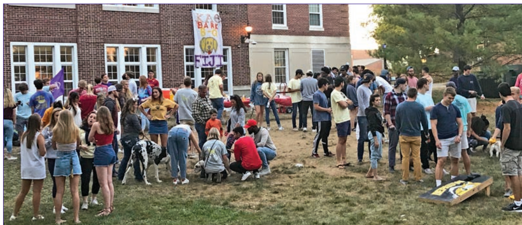
A great day for a philanthropy event!