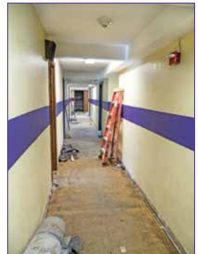
Here's your last view of an interior hallway as it used to be.