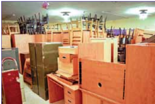
All the remaining study room furniture was moved—a huge effort—to the basement bum room.