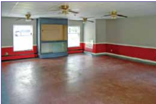
Everything in the dining room and upstairs was removed.

The first three weeks were spent demolishing interior spaces and then removing 50-year-old asbestos tiles and ceiling insulation from the second and third floors.